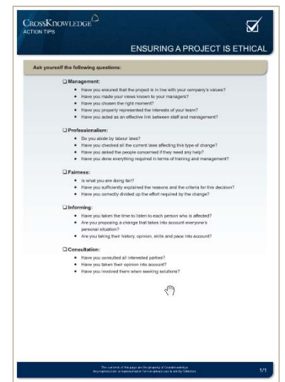
Example of checklist